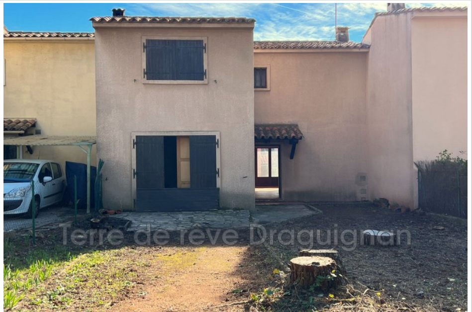
House 5319 Le Cannet-des-Maures